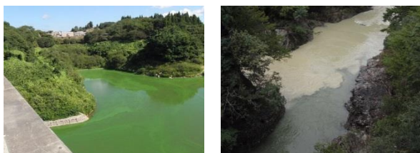
Photo 1: Example of water quality change phenomena in the dam reservoir (Left: Eutrophication, Right: Long-term persistence of turbid water)

In order to advance water quality improvement measures more accurately and efficiently in the severe financial status, it is required to organize the findings and know-how accumulated on water quality improvement measures, points of attention in introduction, etc. and systematize them for utilization.