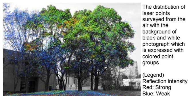
Figure 1. An example of point group data of aerial laser surveying

Laser surveying (LiDAR) is a technology to measure the distance from a target using a laser. Aerial laser surveys enable the three-dimensional identification of trees and buildings on the ground and terrain as the data of point groups (figure 1). Figure 2 shows an example of creating tree-height models (DCHM) that express the three-dimensional quantity of greenery by processing data obtained through aerial laser surveys. The surveys enable the three-dimensional capture of the conditions of green areas, which used to be limited to the identification of the plane surface distribution of greenery in investigations based on conventional aerial photographs. Among the green areas, the effect of reducing the thermal environment differs between turf and trees. The three-dimensional survey of the amount of greenery enables the evaluation of these differences.