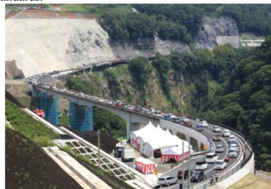
Photo: Resumed service of the Aso Choyou Great Bridge Rout (Aug. 2017)

In the works for restoration from the Kumamoto Earthquake disaster, which happened in April 2016, advanced technical knowledge about bridges etc. has been required and a division was installed in April last year by stationing research personnel on the site in order to accelerate the project. This division is providing prompt and elaborate technical support on the site and contributing to early restoration for projects led by Regional Development Bureaus and local governments. In August last year, 16 months after the occurrence of the Earthquake, service of the Aso Choyou Great Bridge Route, which was seriously affected by the disaster, was resumed, which gave great momentum to restoration of the region (Photo). We intend to provide technical support to restoration works, including the Aso Great Bridge and advance the study on aseismic structure enabling easy functional recovery by collecting and analyzing information obtained on the site according to the progress of work and reflecting it in technical standards.