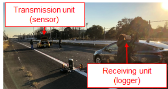
Fig. 1: Experiment using wireless communication

In order to establish a technology using results of this study as a model case and obtain seismic records that contribute to further rationalize / upgrade the seismic design standards for civil engineering structures, we intend to improve seismic behavior observation in the NILIM.