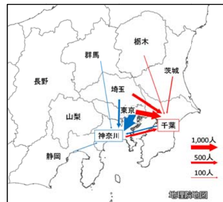
Fig. 1: Example for the breakdown of departure locations of beach visitors

In the Web questionnaire, about 300,000 out of about 4,000,000 people answered the question about whether they visited any mountain, lake, beach, etc. in the last year. Of them, we obtained information in combination of departure and destination locations (OD data) from about 50,000 people (Fig. 1). The differences between prefectures in the number of travelers for sea bathing obtained by the method above were generally the same in the trend as those in the published statistics of the number of beach users.