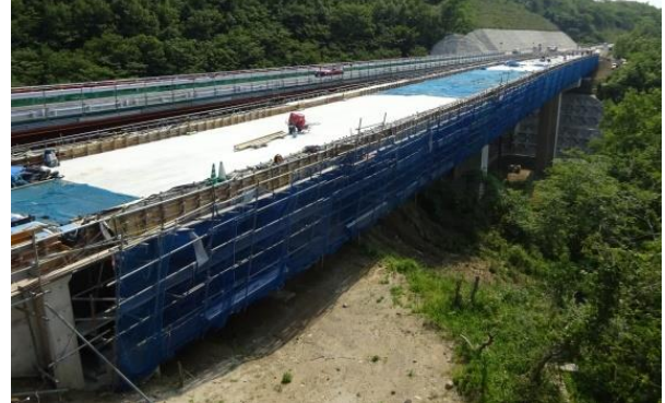
Photo: Tawarayama Bridge under restoration

also giving advice on future management, in addition to guidance on restoration. While providing technical support for early recovery, we will continue to reflect the knowledge obtained in technical standards and study aseismic structure etc. enabling easy functional recovery based on the same knowledge.