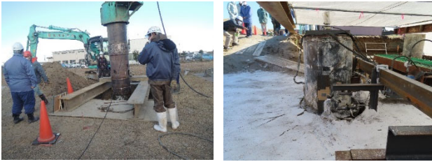
Photo 3. Verifying the characteristics of the soil after removing existing piles

(Left) Removing existing piles (the end-cutting withdrawal method with casing)