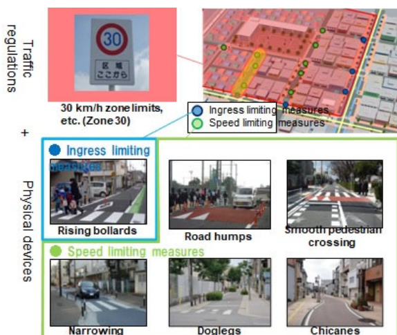
Fig. 1. Images of safety measures for traffic in residential streets

This paper reports on construction methods for asphalt-paved road humps and examples of managing physical devices in winter in snowy areas, which road administrators in particular often inquire about.