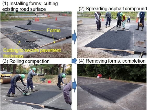
Fig. 4. Construction procedure for sloped portions of road humps

(Can be manufactured at woodworking shops using CAD/PDF data)