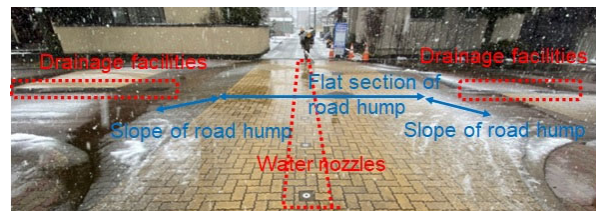
Fig. 6. Example of snow-melting pipe installation