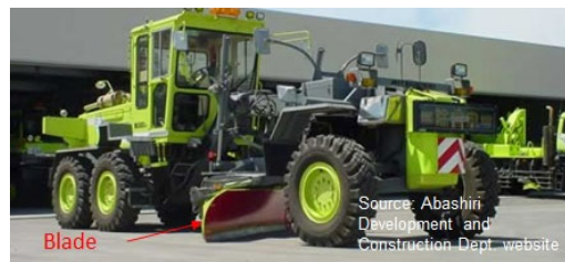
Fig. 5. Example of blade of snow grader