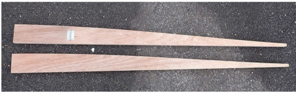
Photo. Forms for sine wave shapes

(Can be manufactured at woodworking shops using CAD/PDF data)