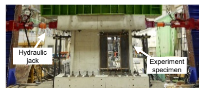
A view of the loading test

Description of the photo on the right. A new opening was formed in the RC experiment specimen simulating a structural wall between two apartments (scale reduced to two thirds). The steel skeleton was used to reinforce the surrounding part, and the horizontal load was applied for simulating seismic loading condition. In this experiment, the experiment specimen with its opening reinforced sufficiently was proved to exercise the lateral load carrying capacity equivalent to, or more than, the standard experiment specimen, which simulated the status before the new opening was formed.