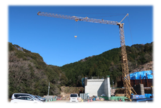
Fig. 3. Fixed horizontal jib crane

standards, manufacturing, and transportation, as well as the work on site, when considering promoting its use.