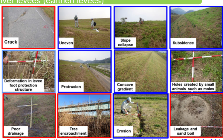
Levee deformations subject to automatic deformation extraction

Traditional approaches to extracting deformations from 3D point cloud data involve time-consuming processes such as converting the data into images and data thinning. Moreover, direct use of 3D point cloud data was not possible, leading to decreased data accuracy. This time, we have developed a technology that directly extracts deformations from 3D point cloud data using Al. This represents the first case of such technology in Japan's river management sector, allowing us to overcome the challenges discussed above.