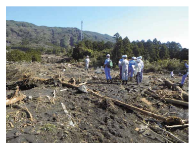
Emergency ground survey

Moreover, NILIM provided advice concerning the organization of results of emergency inspections of locations at risk of sediment disasters performed by the MLIT Regional Office TEC-FORCE immediately after the disaster.