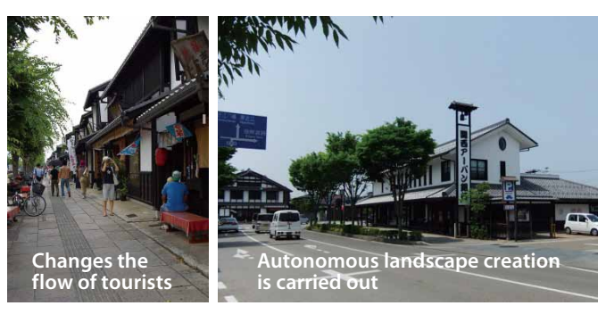
Photo: Example of Effects on Town Planning and Community Development (Yumekyobashi Castle Road (Shiga Prefecture, Hikone City))

Details Candscape and Ecology Division web site http://www.nilim.go.jp/lab/ddg/seika/