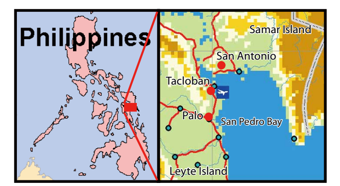
Location Map (from global map data)

The following is an overview of the damage. The storm surge damage increased inside San Pedro Bay, which is a shallow bay that narrows from the outer sea.