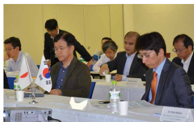
The Joint Workshop

Accompanied by NILIM staff members, they toured Toyama City and Fukui City, which are representative of regional cities conducting urban regeneration. In addition to the regional tour and explanations by city officials, the Korean researchers' understanding of conditions in Japan was further deepened by, providing them with an opportunity to exchange opinions with railway companies and with NPO that are promoting urban policies in cooperation with administrative bodies.