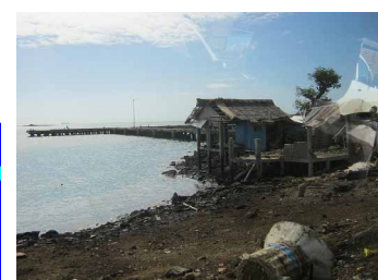
Photo: Damages in Estancia Port