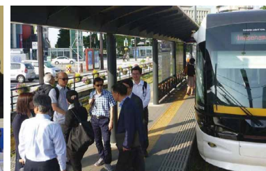
Regional Tour (Toyama LRT)