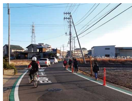
View of the Public Experiment

The social experiment was done in sections where it is difficult to install sidewalks because the road is too narrow, sections which are somewhat wide, but many vehicles travel through at high speed, and streets used by through traffic, by widening or coloring shoulders (where people walk), or by installing structures to slow traffic such as hump (raised road surface) or chicanes (narrowing and adding curves to force vehicles travelling through to swerve