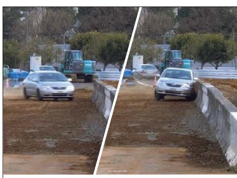
Photo: Testing collision between actual car and protective fence A driver-less car is accelerated by special driving equipment, made to collide with the protective fence at a set collision speed and angle, and the performance of the protective fence is evaluated.

http://www.nilim.go.jp/lab/geg/index.htm