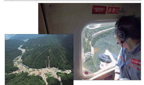
Conducting a survey using a helicopter, and the disasteraffected area seen from above

We carried out technical assistance in relation to the sediment disaster that occurred in Hiroshima, Ehime and Kyoto prefectures by dispatching our staff to those disaster sites.