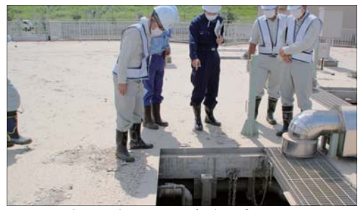
Conducting a damage survey of Mabi Purification Center

In response to Kurashiki City, we sent TEC-FORCE to Mabi Town and participated in the "Study Group for Countermeasure against City Flooding" that responds to flooding disasters, including the heavy rain of July 2018.