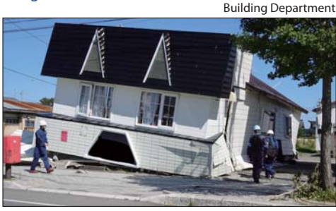
A collapsed dwelling combined with store (Mukawa Town)

Based on the results of quick post-earthquake inspections of damaged buildings provided by each town office, we implemented the survey in various ways, determining which buildings were damaged, carrying out visual inspection, measurement and photography, and interviewing local residents, etc. We also carried out confirmation of the locations and the installation conditions of seismometers in the vicinity in order to analyze the relationship between the seismic motion and the damage caused to the buildings. We responded to media inquiries in our survey location, and an overview of the survey results was reported on TV within the day. Also, we made the survey report public on our website on October 2. In this survey, we often observed that relatively old two-story houses combined with stores were particularly susceptible to collapse or significant deformation. We will continue to analyze the damage to these buildings.